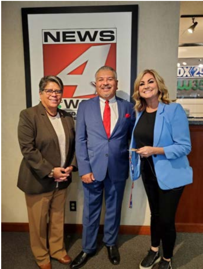
12th Annual Hiring Red, White & You! Veterans Hiring Event | WOAI (news4sanantonio.com)